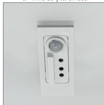
XC daylight&occ sensor