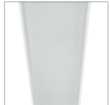
MP19H microprismatic diffusor