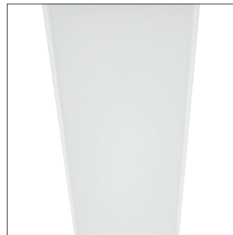
OP white acrylic diffusor